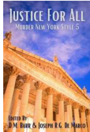
Our chapter launched our 5th Anthology via Zoom in September.