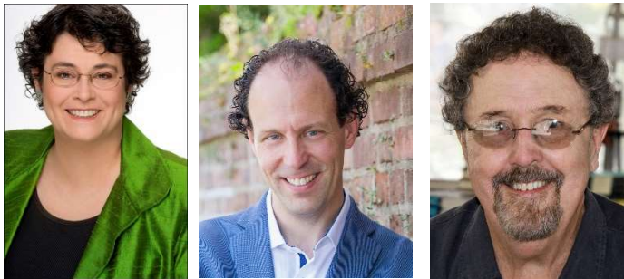
Acclaimed Authors Donna Andrews, Brad Parks and Timothy Hallinan joined us via Zoom in October.

It's hard to summarize this panel in one paragraph, as there were so many great pieces of advice and fabulous one-liners throughout! New York Times Bestselling author Donna Andrews said she looks for "comedy that has heart in it." Brad Parks, the only author to have won the Shamus, Lefty and Nero awards, declared, "The number one way not to be funny is to try really hard to be funny." Edgar, Shamus, Macavity and Lefty nominee Timothy Hallinan said, "You can't write a great joke for a character that really isn't in the character's voice." He also cautioned that humor and suspense were "kind of opposing forces." The evening was an absolutely delight!