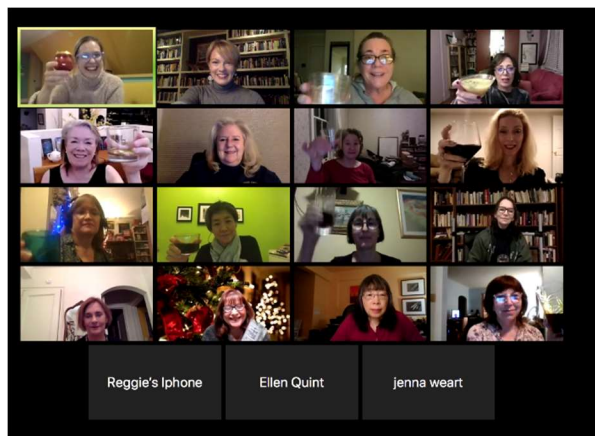
Our chapter celebrates a toast on Zoom.